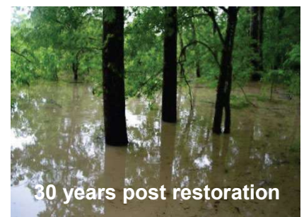
Figure 3. Monitoring restoration sites of varying age supports trajectory development.