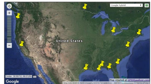
Figure 2. Study locations.