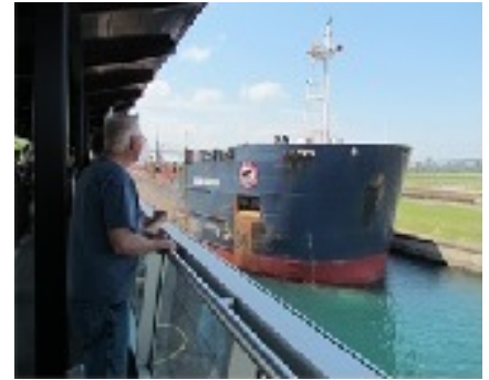
Soo Locks Observation Deck.

Future anticipated deliverables associated with this project will include, but are not limited to: (1) project reports and renderings that will be provided to the respective districts; (2) Tech Note that describes approach/methodology for prioritizing and ranking of existing Corps infrastructure projects that were identified as candidates for EWN integration; (3) Journal Article that characterizes the projects and approach for integrating EWN application; and round table discussions with respective districts to showcase product deliverables including reports and applicable project renderings.