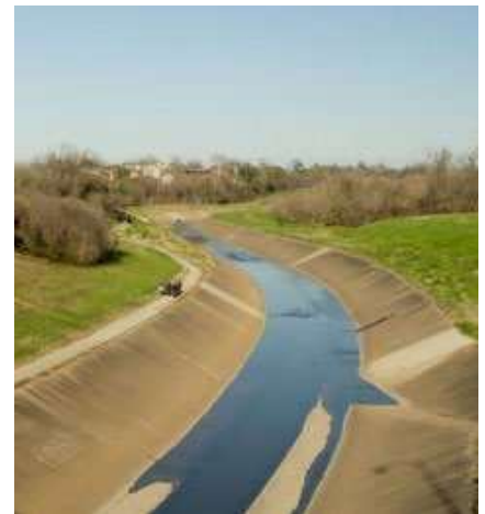
Traditional canal design that conveys water.