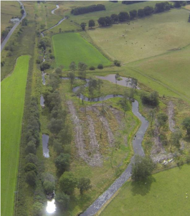
Photo 1: Aerial photo of the Eddleston Water project