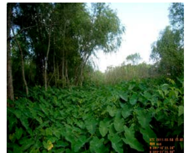
Figure 2. A diverse assemblage of native vegetation is colonizing the island.

Point of Contact: Burton Suedel, Ph.D. Burton.Suedel@usace.army.mil; Ph: 601-634-4578