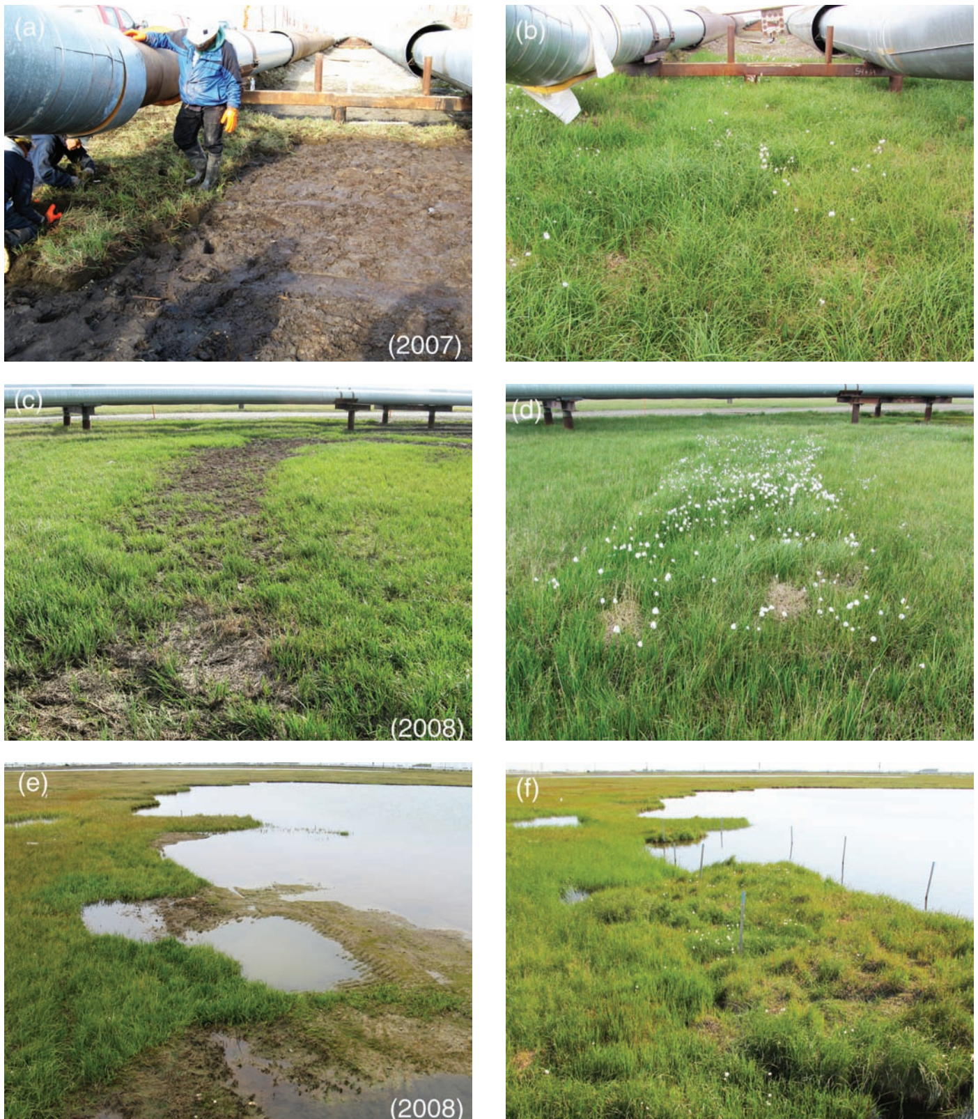
FIG. 2. View of sites before sod was transplanted (left) and again in 2012 (right). (a, b) Site A; (c, d) Site B; (e, f) Site C.

with the location and length of transects determined subjectively from the size and shape of the area treated with tundra sod (Table 2). Percent cover was also measured in undisturbed tundra situated immediately adjacent to the