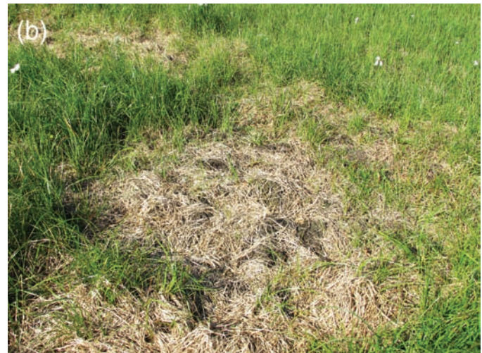
FIG. 4. (a) The sodded area at Site D surrounded by undisturbed tundra, and (b) a patch of dead vegetation attributed to microtine activity after tundra sodding at Site B.