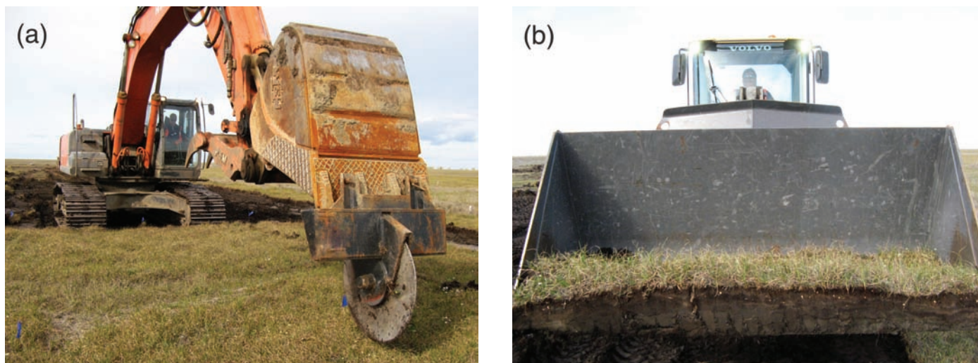
FIG. 3. (a) The mechanical sod cutter ( nuna ulu ) making vertical cuts at the harvest site, and (b) the loader used to remove large blocks of sod.