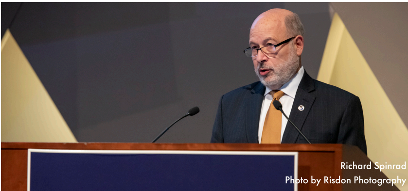
Richard Spinrad

Another overarching Summit theme reflected the manner in which nature-based solutions can be used to increase equity.