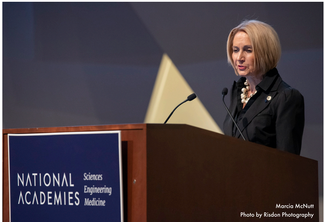
Marcia McNutt

“We know that nature-based solutions not only make our infrastructure more resilient to natural hazards, but by being more resilient, natural infrastructure can also lessen financial burdens from incredibly thorny problems such as climate change,” said Marcia McNutt, President, National Academy of Sciences.