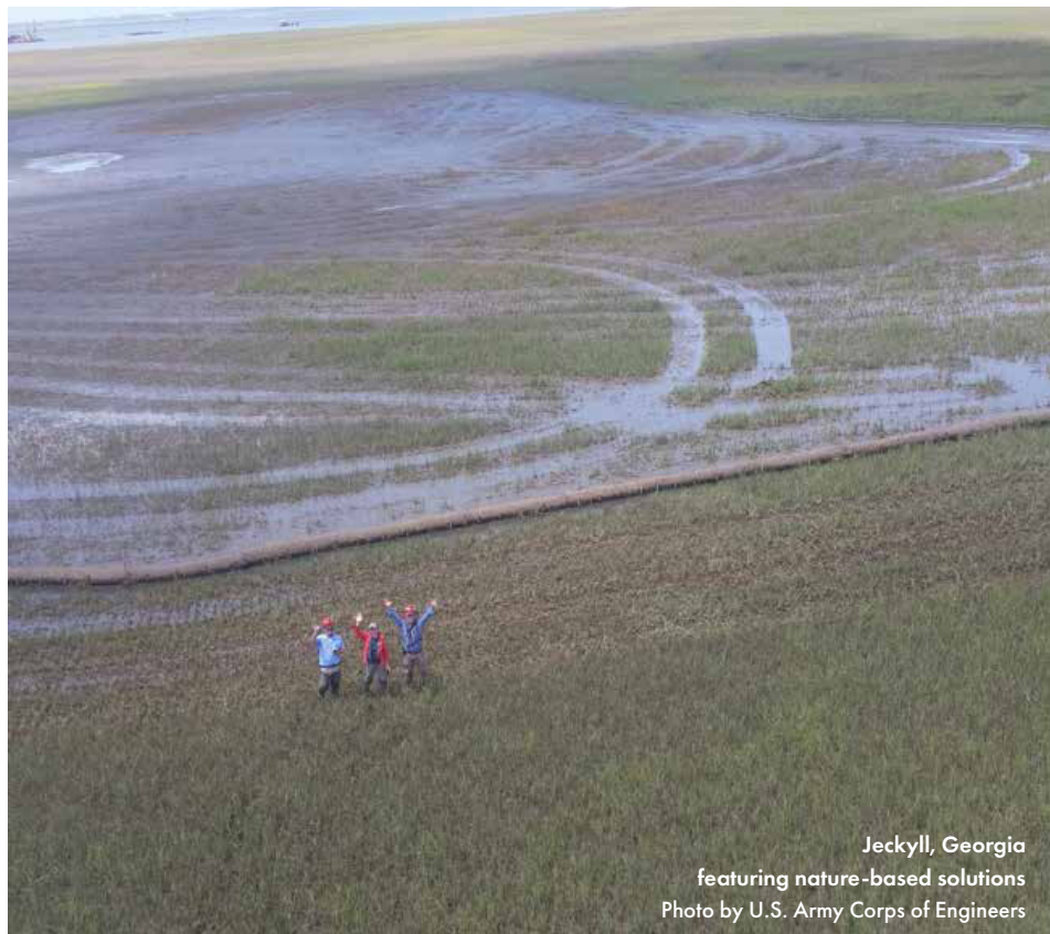
Jeckyll, Georgia featuring nature-based solutions

Online comments submitted during the summit included questions about how new ways of BCA would be adopted, how they could be implemented post disaster for better adaptation, and how will cross-agency adoption of nature-based solution strategies move forward.