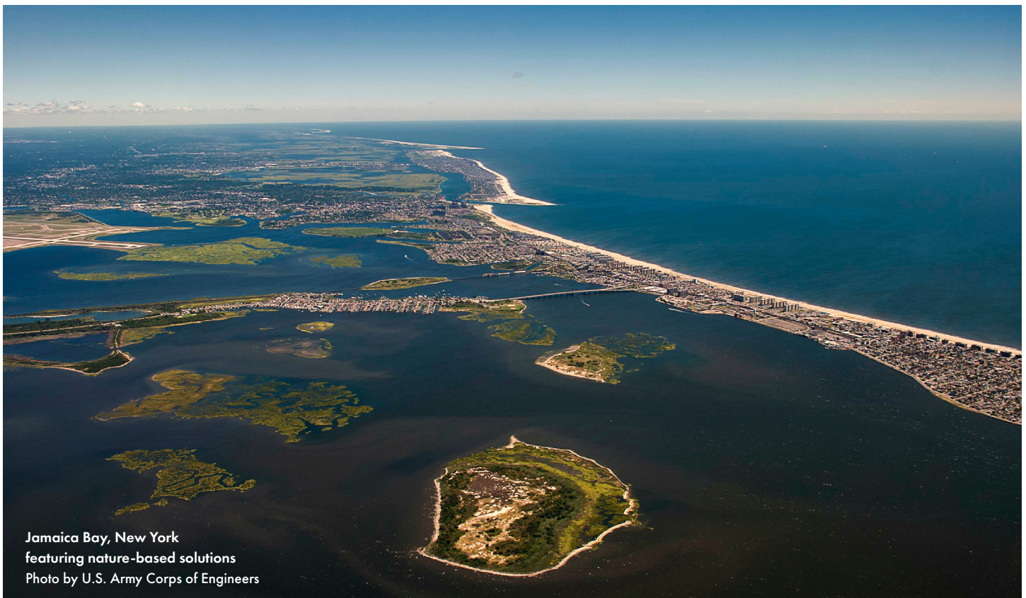
Jamaica Bay, New York featuring nature-based solutions